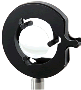
Figure 1: ThorLabs SCL03 lens holder

We supply a ThorLabs SCL03 lens holder with each OS100 system: